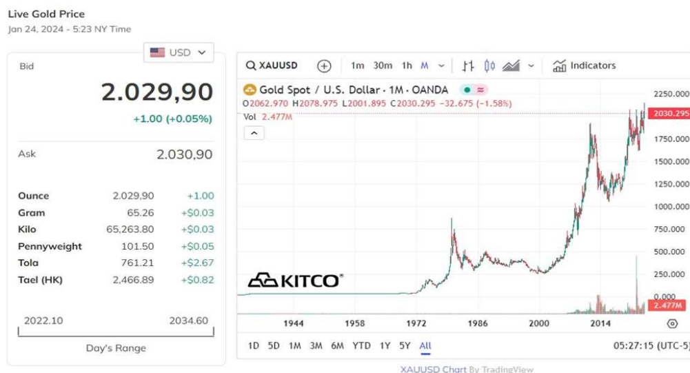
Figure 1 Gold Spot Price in U.S. Dollars Since Bretton Woods July 1944 2

No solution is found to the fundamental issue that gold was the mean of payment value standard to be fixed and generally accepted, in a system where inflation and national deficits were always out of line and ungovernable.